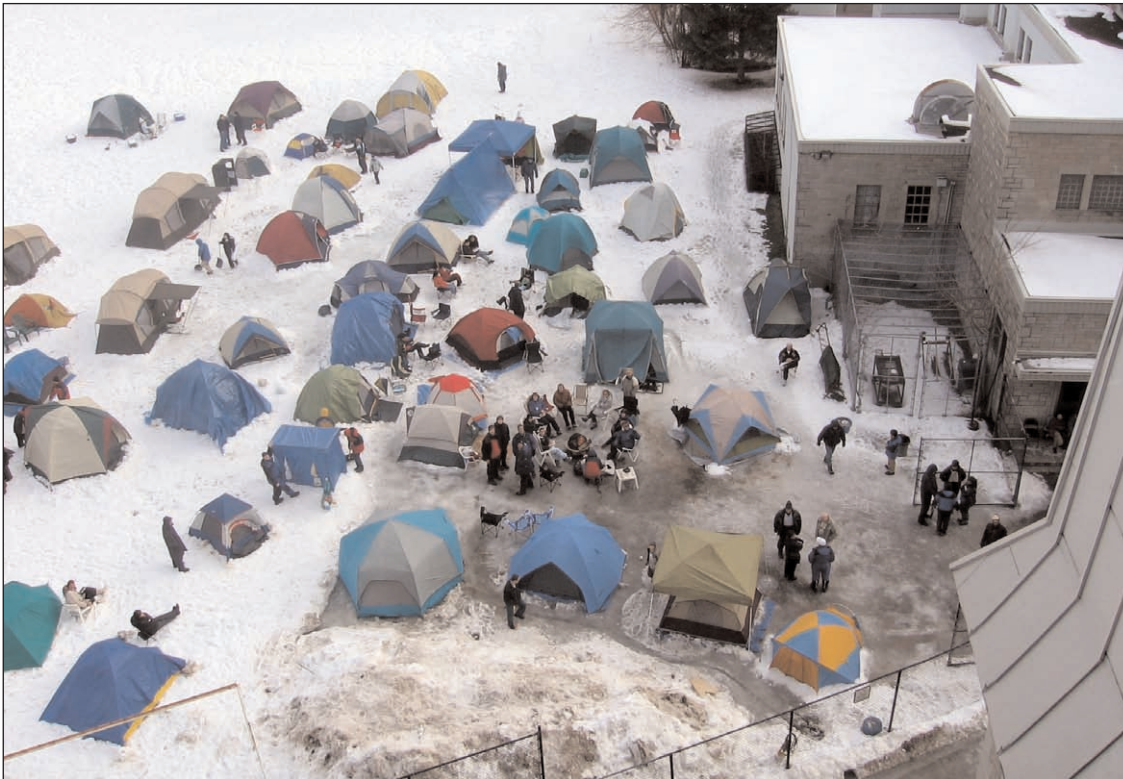
LISGARVILLE: Eager parents have in the past turned the school's soccer field into a small tent city when cross-boundary transfer spots became available.