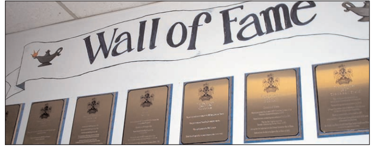
GO FOR THE GOLD: Many of the athletes on Lisgar’s Wall of Fame have participated in the Olympics.

While some names have already been submitted, we would ask the help of all alumni in identifying possible nominees. Nominations can include any aspect of the world of sport and any era of the school’s history; the nominee must have attended Lisgar but, as with any of our alumni, need not have been a graduate. The nomination could simply give the athlete’s name, but any additional information, documents, clippings, etc. would be most welcome, as each