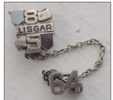
PLEASE HELP: Mystery pin has archivist baffled.