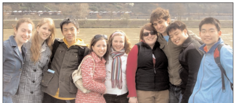
TALES FROM THE VIENNA WOODS: Orchestra members pose for a photo while on their Europe tour.

The groups performed three times and were very warmly received. The audiences for two of the concerts consisted of German students, who were